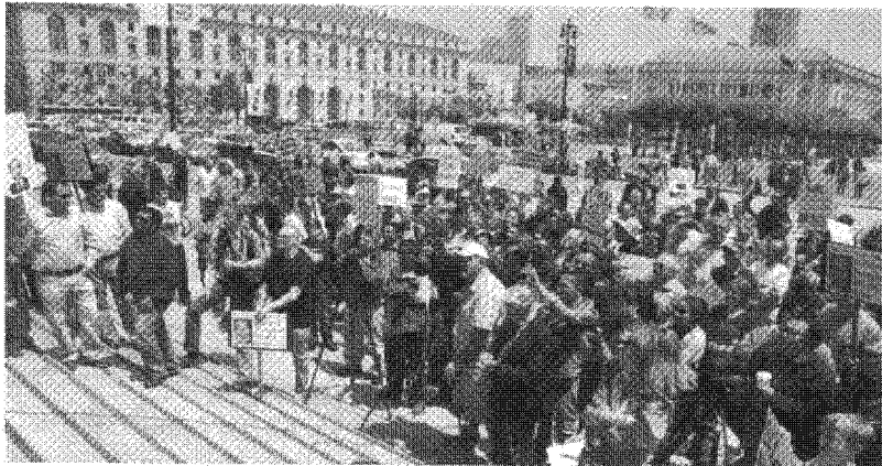
July 30, 2013 protest of San Francisco taxi workers against the legalization of TNCs.

While many on the initial National Taxi Workers' Alliance conference call questioned not just whether the TNC workers should be organized in tandem with the taxi workers, but also whether they actually could be organized given that they do not congregate in the way that taxi workers do, 317 the TNC workers have since demonstrated that exploitation produces collectivity, even in the most unlikely of conditions. On June 14, 2014, in front of Uber headquarters in San Francisco, over 250 Uber drivers converged for the first time to protest Uber's exploitative employment practices. In chanting their demands, the protesting drivers demanded that Uber stabilize their wages and take responsibility for some of the risks and liabilities of driving. Notably, these demands were strikingly similar to those made by San Francisco taxi workers in the early 1900s.