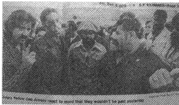
Angry Yellow Cab drivers find out they are out of work and will not be paid in December 1976. Raul Ramirez, supra note 155 at 3.