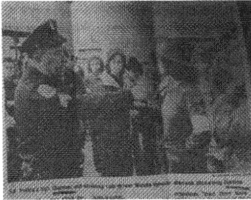
Picketing non-medallion holding yellow cab driver, demanding employee status in 1979. Daniels, supra note 174.