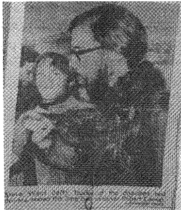
"Long-Haired Cab Drivers Rap Union." San Francisco Examiner . April 13, 1970.

In other instances, drivers who did not think the Union was acting in their best interests engaged in "extra-union" protest activity. For example, in 1970, thirty Yellow Cab taxi workers picketed City Hall without the Union's backing "to let the city fathers know what is going on at the airport" with cab drivers from other cities "pirating" their fares. 106 The same year, 169 non-union taxi workers, most of them working for independent operators, signed a petition to repeal an ordinance mandating bulletproof shields inside taxicabs. 107 Although the majority of union drivers had voted in favor of the shields, the independent operators explained that had their votes been counted too, the result would have been not to install the shields. 108 The Board of Supervisors unanimously repealed the ordinance the following year after learning that it was a contentious issue among drivers. 109