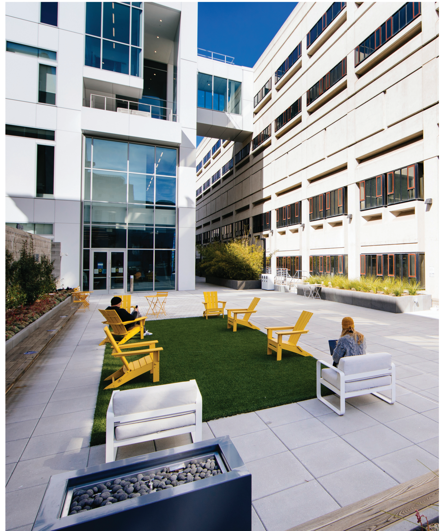
Our new Quad connects the Cotchett Law Center with Mary Kay Kane Hall at 200 McAllister Street.

Multiple metrics make it clear: UC Hastings is moving up in every arena of activity, including its skyline.