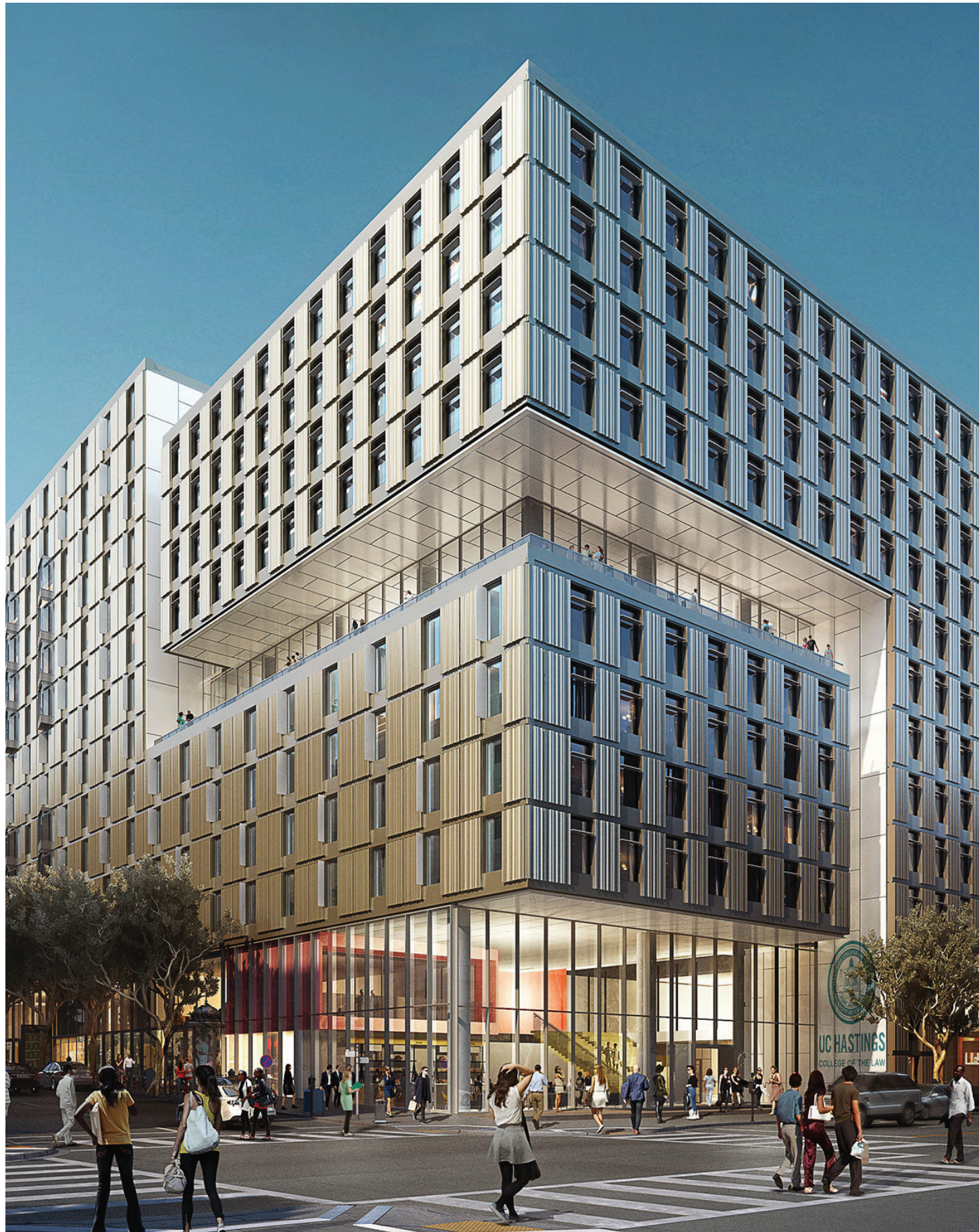
Our 15-floor building at 198 McAllister Street—with 12 floors of student housing—is slated for completion in June 2023.