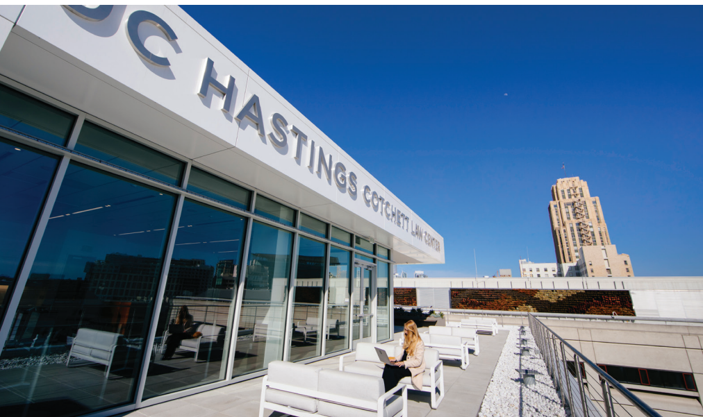
A Sky Deck tops the new Cotchett Law Center at 333 Golden Gate Avenue.